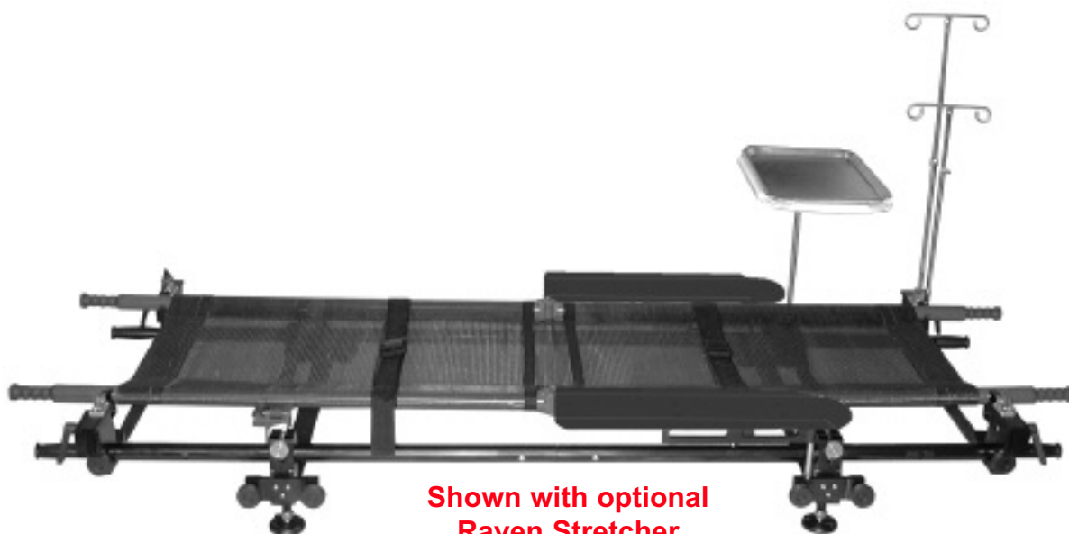
Shown with optional Raven Stretcher

The SR501RT is the table top version of our successful SR901RT. When weight and cube are important and all of the capabilities of the SR901RT are not required, the SR501RT is the perfect choice. Lightweight and compact makes this the ideal piece of equipment for use in combat situations or remote civil applications where a treatment platform is desirable. This unit comes with two (2) Arm Boards, two (2) IV Poles, and one (1) Mayo Tray two (2) Medical Accessory Towers with two (2) Impact Mounting Clamps (Accessory Kit A NSN# 6530-01-529-4842). Available accessories include Stirrups (Accessory Kit B NSN# 6530-01-529-4859); Optional lights (Accessory Kit C NSN# 6530-01-529-4857); PAX LED Lighting System (NSN# 6530-01-549-1089); Legs SR681 (NSN# 6530-01-529-4546); Back Rest (SR700BR) (NSN# TO BE ASSIGNED) and either the Raven or Talon Stretchers. Unit weighs 80 lbs. with a weight capacity of 500 lbs.