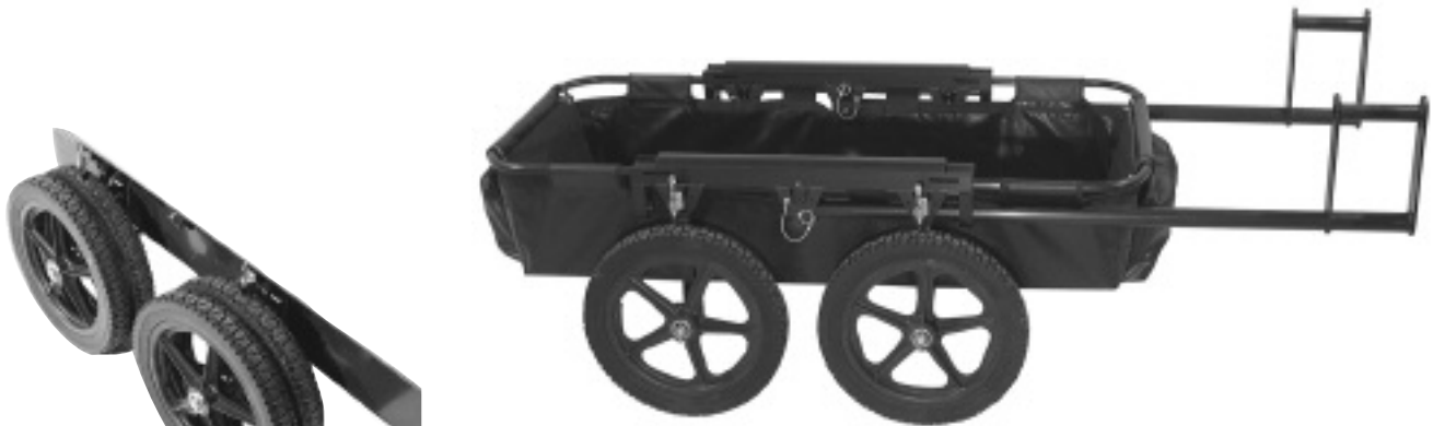
CH471 Dual Wheel Option

CH401M4 is the workhorse of the Charlie's Horse® Deployment System. It is a four-wheeled super duty, multi-purpose, collapsible cart which multiplies the effectiveness of men deploying material into remote areas without heavy lift equipment. The unique design of this unit allows for the four wheels to be expanded to six or eight, depending on mission requirements, enhancing maneuverability and stability over diverse terrain. When combined with the CH661 SERIES of fiberglass composite canisters, a package results that is unsurpassed in its ability to deploy personnel, equipment and supplies with limited manpower. The CH401 models have the unique capability of adapting to transport stretchers, tents, ordnance and a host of other equipment when outfitted with a set of accessory clamps and racks. Standard components include a Carry Bag, Wagon with Hard Polymer Bottom and Ends, pair of Detachable Saddlebags. Available accessories include, Dual Wheels (CH471NSN# 3920-01-511-3701), four (4) Accessory Clamps (CH411), Fiberglass Composite Canisters (CH661 Series), Harness (CH491) and either Raven or Talon Stretchers. Custom Racks and Mounts are available. Unit weighs 90 lbs. with a cargo capacity of 750 lbs. Cargo area is 22" x 55" x 10".