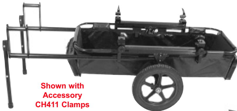
Shown with Accessory CH411 Clamps

CH401M2 is a two-wheeled, heavy duty, multi-purpose, collapsible cart which multiplies the effectiveness of men in the field while reducing fatigue. When combined with the available accessories, a package results that is unmatched in its ability to deploy personnel, equipment and supplies with limited manpower. The CH401 models have the unique capability of adapting to transport stretchers, tents, ordnance and a host of other equipment when outfitted with a set of accessory clamps and racks. The CH401M2 is currently being deployed by the US Army. Standard components include a Carry Bag, Wagon with Hard Polymer Bottom and Ends, and a pair of Detachable Saddlebags. Available accessories include, Dual Wheels (CH471 NSN# 3920-01-511-3701), four (4) Accessory Clamps (CH411), Fiberglass Composite Canisters (CH661 Series), Harness (CH491) and either Raven or Talon Stretchers. Custom Racks and Mounts are available. Unit weighs 80 lbs. with a cargo capacity of 500 lbs. Cargo area is 22" x 55" x 10".