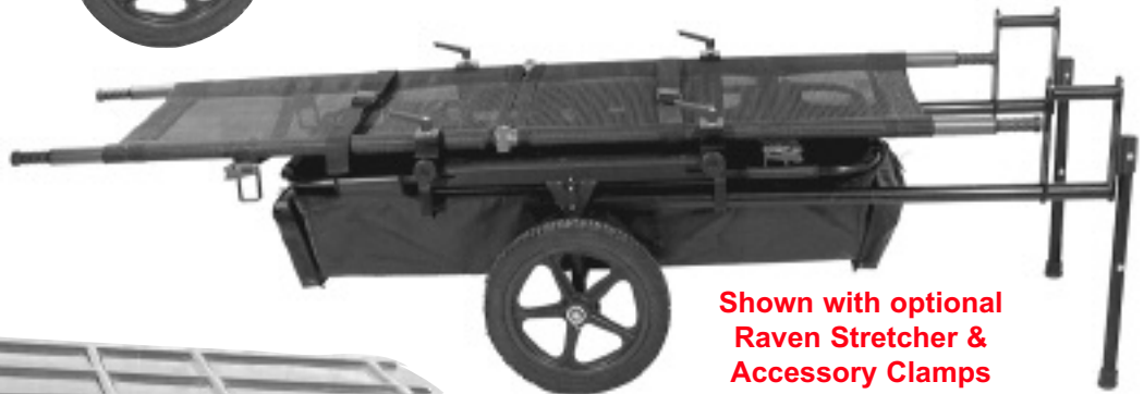
Shown with optional Raven Stretcher & Accessory Clamps CH411

DIMENSIONS ASSEMBLED 78" X 31" X 21" SHIPPING 54" X 28" X 8" SHIPPING WEIGHT 90 lbs.