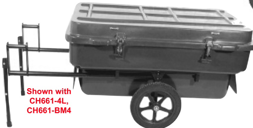
Shown with CH661-4L, CH661-BM4